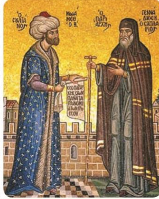
Resim 2.2: İstanbul'daki Fener Rum Patrikha-nesinin duvarında bulunan ve Fatih'i Gennadios'u Ortodoks patriğine atadığına dair fermanını verir-ken gösteren mozaik resim (1454)

"Ben Ulu Padişah, Ulu Şehinşah Sultan Mehmet Han'ım. Galata halkı, üzerlerine askerimle varıp kalelerini yıkıp harap etmeyeyim diye elçilerini bana göndermişler. Buyurdum ki malları ve rızıkları ve mülkleri ve mahzenleri ve bağları ve değirmenleri ve gemileri ve sandalları ve çocukları ellerinde kalsın. Onlar dahi rençberlik et-sinler. Denizden ve karadan sefer yapsınlar. Kimse engel olmasın. Memleketimin diğer yerlerinde olduğu gibi kili-seleri ellerinde kalsın ve ayinlerini okusunlar. Ceneviz tüccarları karadan ve denizden ticaret yapıp gelsinler ve git-sinler. Vergilerini âdet olduğu üzere versinler. Onlara kimse düşmanlık etmesin. Buyurdum ki nızası olmadan hiç-biri Müslüman yapılmaz. İçlerinden kimi isterse onu elçi olarak seçsinler." (1)