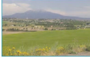
5.3. Fotoğraf: Malazgirt Savaşı'nın yapıldığı Malazgirt Ovası'ndan bir görünüm (Muş)

Anadolu'ya Selçuklu akınları başladığında Bizans'ta daha önceden de var olan iç karışıklıklar artarak devam etmekteydi. Merkezdeki taht kavgaları yüzünden eyaletler ihmale uğramıştı. Bizans kuvvetleri çoğu zaman ihtiyaçlarını karşılamak için şehir ve köyleri yağmalyordu. Bu kargaşadan kurtulmak ümidiyle Bizans İmparatorluğu'na "Romanos Diyojen" (Romen Diyojen) getirilmişti. İmparator olan Diyojen Türk akınlarını durdurmak için hazırlıklara başladı. Amacı sadece Türk akınlarını önlemek değil bütün İslam ülkelerini ele geçirmek Bizans'ı Türk tehlikesinden kurtarmaktı. 200 bin kişilik bir ordu ile Türklerle karşı sefere çıkan Bizans ordusunun içinde çeşitli milletlerden oluşan ve kiminle savaşacaklarını bilmeyen paralı askerler de bulunuyordu. Bizans'ın güçlü bir ordu ile Anadolu'ya yönelik sefer başlattığı haberi üzerine Alp Arslan, süratle Doğu Anadolu'ya yöneldi ve birtakım hazırlıklar yaptı. Alp Arslan, bu sırada Bizans imparatoruna elçi göndererek barış teklifinde bulundu. Bu teklif imparator tarafından reddedildi. Diyojen'in red cevabı Selçuklu ordusunun savaş azmini büsbütün artırdı ve neticede iki ordu 26 Ağustos 1071 tarihinde yanda resmi gösterilen Muş'un Malazgirt Ovası'nda karşı karşıya geldiler.