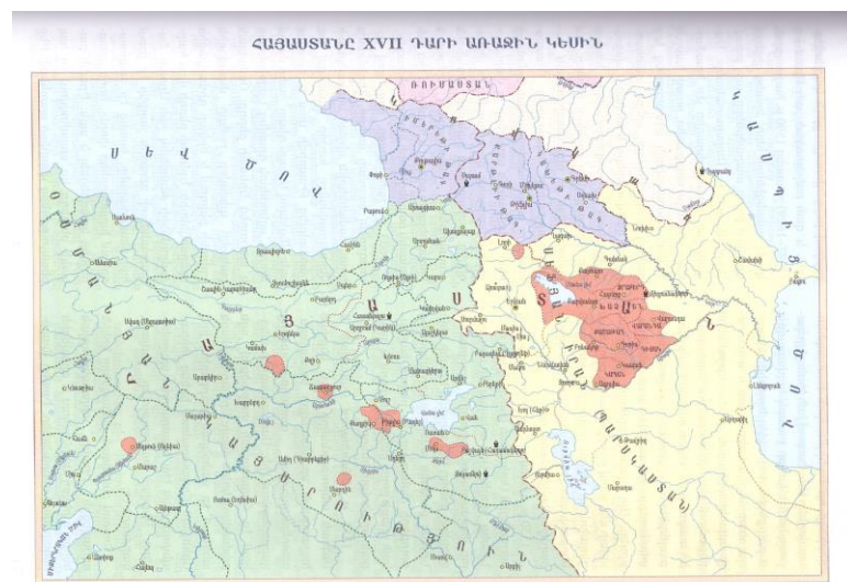
Figure 4. The caption to the map reads, “Armenia in the First Half of the 17th Century” (Melkonyan, Barkhudaryan, et al. 2015, 73).

authority in Van” following the self-defense of Van in 1915 as a “precursor of the restored Armenian independence three years later” in the territory of modern-day Armenia (Melkonyan, Barkhudaryan, et al. 2015, 261).